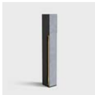
(Belgian) blue natural stone