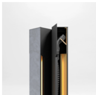
Blue Natural Stone